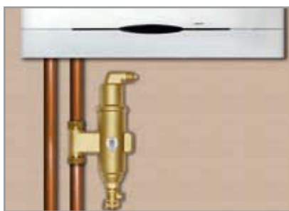
The results of the test were quite clear: no follow-up visits needed to be made to the systems fitted with a SpiroCombi.

Half of the 1000 properties in a complex were fitted with a SpiroVent deaerator. A good four years later, the number of problems, repairs and service visits was consulted and it was noticed that the properties with a SpiroVent deaerator appeared on the list far less often. The number of complaints and problems relating to the properties with a SpiroVent was almost 70% lower. In addition, 80% fewer expansion tanks had had to be replaced while 60% fewer pumps had been replaced.