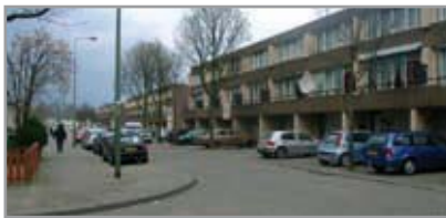
Far fewer complaints and far fewer pump and expansion tank breakdowns.

The use of Spirotech products ensures a higher level of comfort for occupants and users and consequently fewer complaints. The products also protect the system so that it will have a longer life.