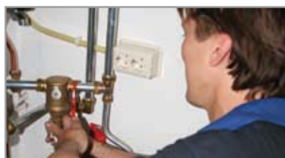
SpiroVent and SpiroTrap fitted as standard in every heating system.

While renovating 160 heating systems, a housing corporation decided to fit 50% of the properties with a SpiroCombi deaerator and dirt separator. Circulation problems arose in 24% of the houses without a SpiroCombi. These problems did not occur in the houses with a SpiroCombi; these convincing figures helped the decision by the housing corporation to fit all the boilers for both new and renovation projects with a SpiroCombi. According to the housing corporation, this product provides real value for money, not only in the short term but also in the long term by protecting the systems.